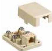
Telephone Surface Mount Jack, 6-Position, 4-Conductor, Screw Terminations