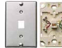
Wall Phone Jack, 6-Position, 4-Conductor, Screw Terminations