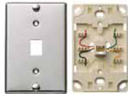
Wall Phone Jack Quick Connect, 6-Position, 4-Conductor, Punch-Down Termination Tool Included