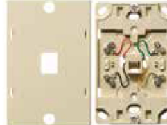
Wall Phone Jack, 6-Position, 4-Conductor, Screw Terminations