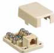
Telephone Surface Mount Jack, 6-Position, 6-Conductor, Screw Terminations